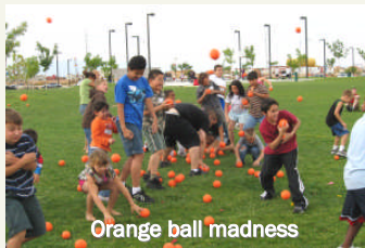
Orange ball madness