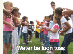
Water balloon toss

Buckets-o-fun has confirmed their partnership to provide new games and equipment for this year. The children will not be disappointed. Let's pray for a huge harvest.